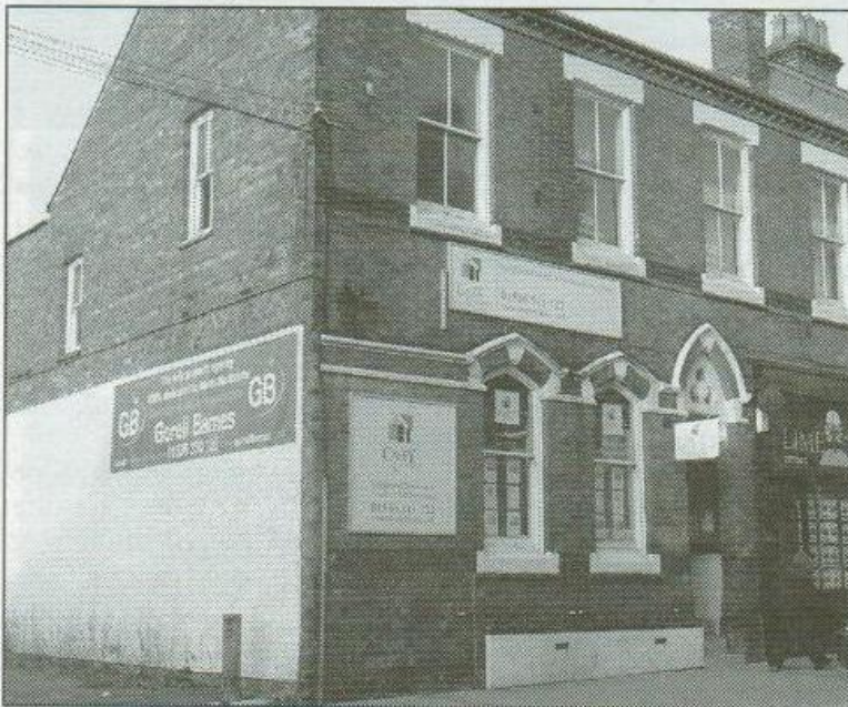
Kettering Council is starting work on the regeneration of The Yards to the rear of 11 and 11a Market Street.